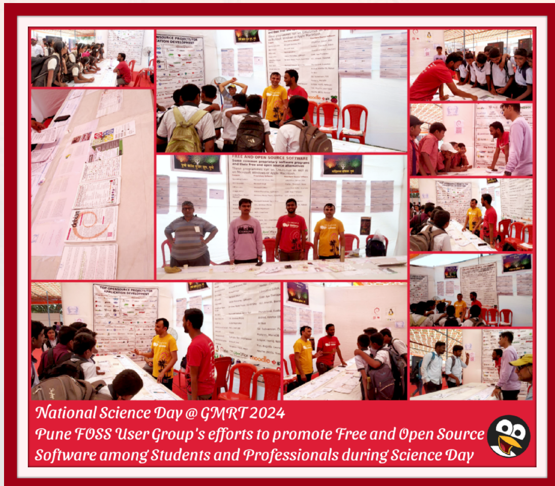
Figure 2: Science Day 2024