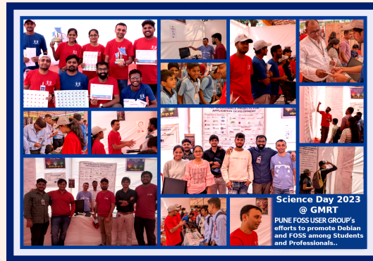
(b) Science Day 2023