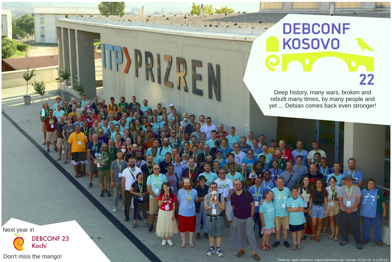
DebConf attendees at DebConf22 in Prizren, Kosovo